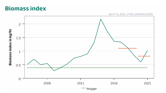
Figure 1 Plaice in Division 7.e. Summary of the stock assessment. ICES landings and discards (estimates available since 2012) and stock biomass index from the UK-FSP survey. The horizontal orange lines indicate the average of the biomass index for 2017 to 2019 and for 2020 to 2021.